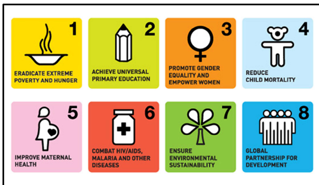
Figure 1. The eight Millennium Development Goals (MDGs) set in the year of 2000 and to be achieved by target date of 2015. These goals ranged from halving extreme poverty to attenuating the spread of HIV/AIDS, providing universal primary education, as well as reducing child mortality and improving maternal health [24].

A global action through an initiative named as the ‘Millennium Development Goals (MDGs) for 2015’ was set in the year 2000 by the United Nations (UN). This was established following the adoption of the UN Millennium Declaration [24]. This 15-years initiative plan was supported by all 189 UN member states at that time and at least by 23 international organizations, including WHO which committed to help achieving the MDGs by the year 2015.